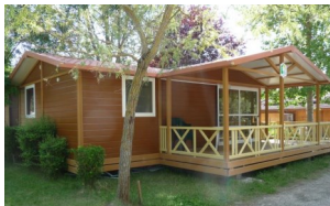
Chalet PMR & Chalet Samoa